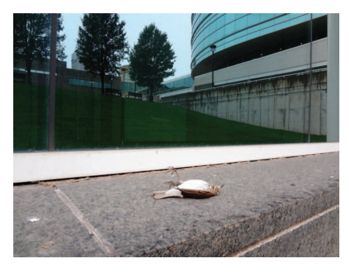
FIGURE 1. A Swainson's Thrush killed by colliding with the window of a low-rise office building on the Cleveland State University campus in downtown Cleveland, Ohio.

Research on bird-building collisions typically occurs at individual sites with little synthesis of data across studies. Conclusions about correlates of mortality and the total magnitude of mortality caused by collisions are therefore spatially limited. Within studies, mortality rates have been found to increase with the percentage and surface area of buildings covered by glass (Collins and Horn 2008, Hager et al. 2008, 2013, Klem et al. 2009, Borden et al. 2010), the presence and height of vegetation (Klem et al. 2009, Borden et al. 2010), and the amount of light emitted from